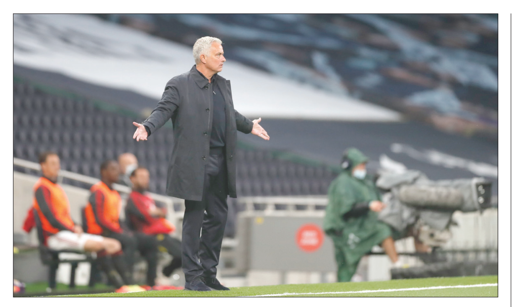
'I had no bench to react to it!' - Mourinho says Spurs lack substitute options

The Catalans, who have been keen on re-signing the forward but now look unlikely to do so given the financial issues of the coronavirus pandemic, saw a judge rule in their favour over a signing-on bonus dispute with their former player.